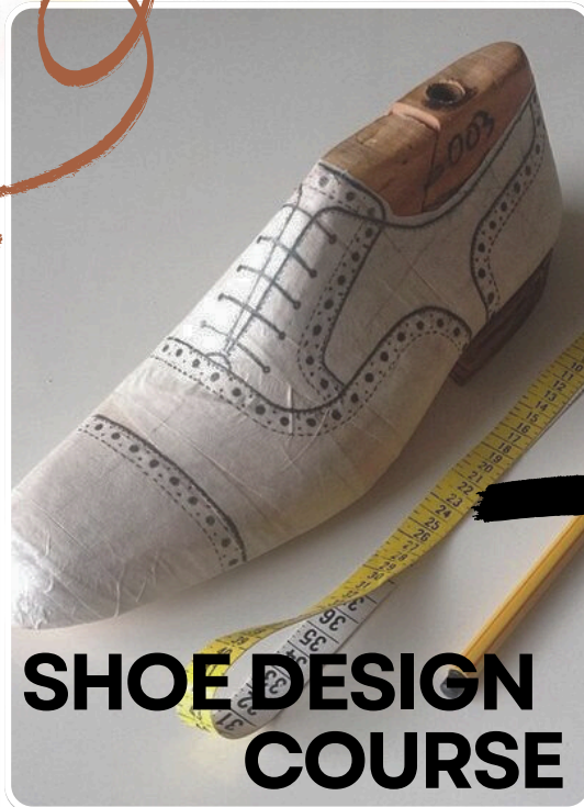
SHOE DESIGN COURSE